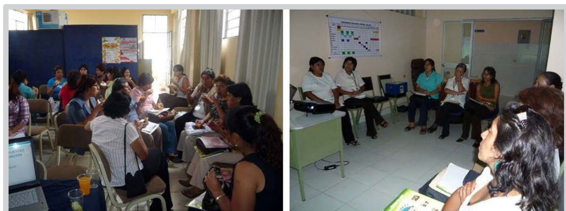
Medical Chiefs of 43 Health Facilities of the 3 Networks.

In Ugel 4 in Comas, we presented to the Directors of Public Schools of the districts of Comas, Carabayllo, Puente Piedra and Ancon. The meeting was also attended by promoters of the Ugel Tutoring since 2008, coordinating joint activities.