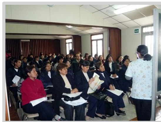
SEMINAR of the “Tupac Amaru” NETWORK, in the districts of Independencia, Comas and Carabayllo, attended by 70 Professionals, in the auditorium of the Santos de los Ultimos Dias de Tahuantinsuyo - Independence.

SEMINAR of the Health Network “Tupac Amaru”, of the districts of Independencia, Comas and Carabayllo, attended by 70 Professionals, in the auditorium of the Church Santos de los Ultimos Dias de Tahuantinsuyo - Independencia.