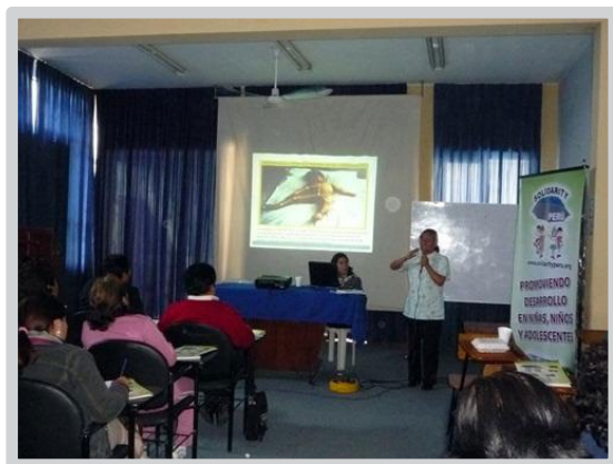
SEMINAR OF THE “PUENTE PIEDRA” NETWORK, of the districts of Puente Piedra, Santa Rosa and Ancon, attended by 50 Professionals, in the auditorium of the Puente Piedra Hospital.