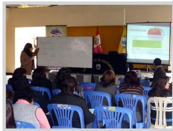
A SEMINAR TO TRAIN 40 TEACHERS IN THE DISTRICTS OF INDEPENDENCIA, LOS OLIVOS AND SAN MARTIN DE PORRES - AUDITORIUM OF THE UGEL 2.