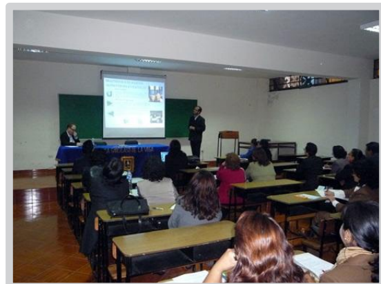
SEMINAR OF “RIMAC” NETWORK, in the districts of RIMAC, SAN MARTIN DE PORRES AND LOS OLIVOS, attended by 80 professionals, in the auditorium of the Faculty of Nursing at the Private University “Inca Garcilaso de la Vega”.