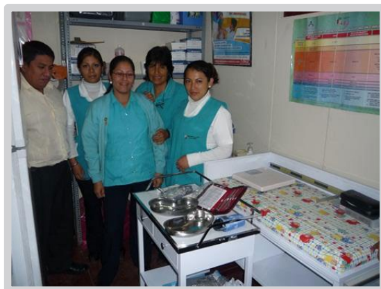
Túpac Amaru Network.