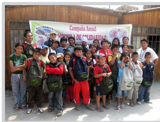
30 Children and Adolescents in the Districts of Puente Piedra, Ventanilla and Ancon, in coordination with the Health Network "Puente Piedra".