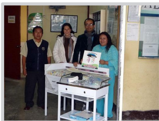
Puente Piedra Network.