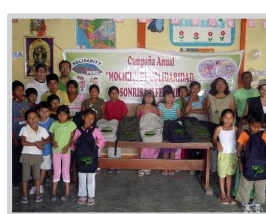
25 Children who live in extreme poverty of the Shanty Town Las Casuarinas - Comas District, in coordination with SOS Children's Villages.