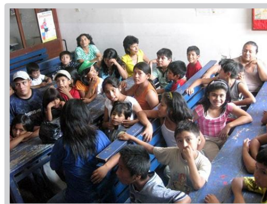
25 Children and Adolescents of 3 Schools of the district of San Martin de Porres.