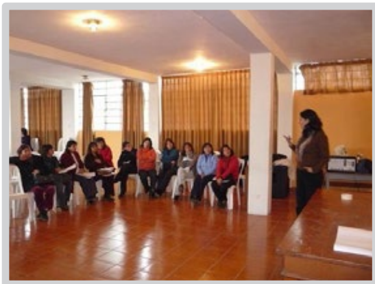
Training for teachers of UGEL 2 - Rimac