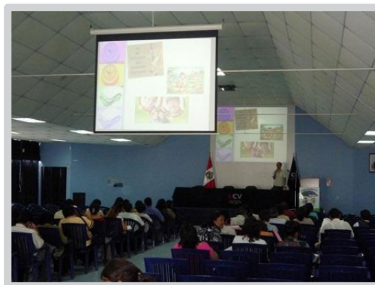
A SEMINAR TO TRAIN 100 TEACHERS OF THE DISTRICTS OF COMAS, CARABAYLLO, ANCÓN, SANTA ROSA AND PUENTE PIEDRA IN THE PRIVATE UNIVERSITY “CESAR VALLEJO”