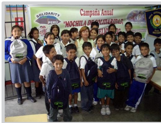
120 Working Children and Adolescents in 4 Schools of the district of Independencia.