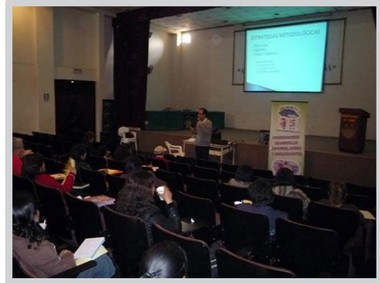
A SEMINAR TO TRAIN 150 TEACHERS IN THE DISTRICTS OF COMAS, CARABAYLLO, ANCON, SANTA ROSA AND PUENTE PIEDRA – AT THE MUNICIPAL AUDITORIUM OF COMAS.