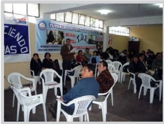
Training for teachers of UGEL 4 - Comas

In coordination with Ugel 02 and 04, seminars were organized for teachers who defend and promote the rights of children and adolescent in the Educational Institutions of North Lima.