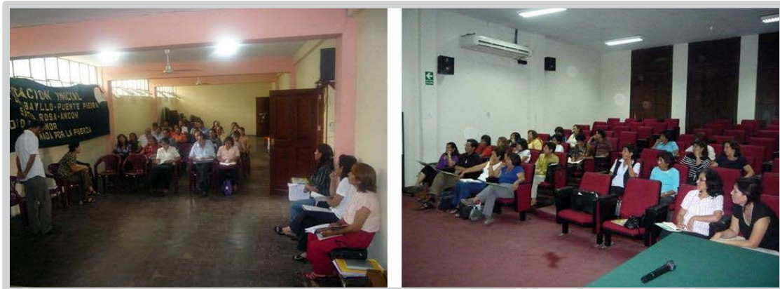
Directors of the 56 Public Educational Institutions from Ugel 2 and 4.

As part of the schedule for our Projects in 2009 - 2010, we coordinated with the Directors of Public Schools from the Local Education Management Units 02 and 04 of Northern Lima in meetings during March and April 2009.