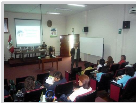
A SEMINAR TO TRAIN 40 TEACHERS OF THE DISTRICTS OF INDEPENDENCIA, LOS OLIVOS AND SAN MARTIN DE PORRES IN THE NATIONAL ENGINEERING UNIVERSITY.

During April and May 2009 over 30 first and second grade teachers of public schools from UGEL 02 of the districts of Independencia, Los Olivos and San Martin de Porres in Northern Cape Lima were trained in seminars on how to promote the campaign “For the Right to a Name and Identity” at the Auditorium of the Faculty of National Petroleum Engineering University. (April 29, 2009).